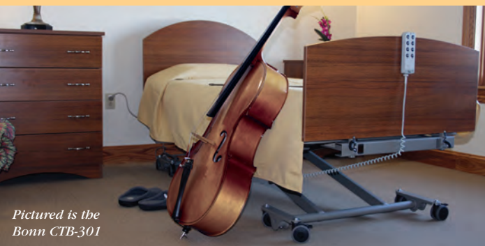
Pictured is the Bonn CTB-301

The Bonn CTB-301 and the Salzburg CTB-601 share the same frame which includes width adjustment to 42 inches. Both are suitable for assisted living and long-term care use. They come standard with wall bumpers, roll at any height convenience and 450 lb. weight capacity. The Salzburg has the added capability of a one step floor lock and options that include battery back-up and a footboard staff control with a resident lock-out feature.