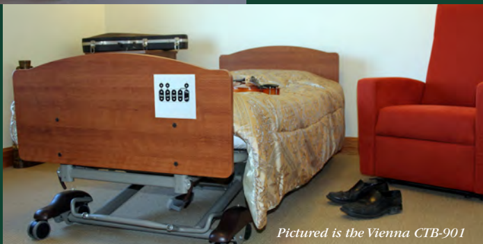
Pictured is the Vienna CTB-901

The Bonn CTB-301 and the Salzburg CTB-601 share the same frame which includes width adjustment to 42 inches. Both are suitable for assisted living and long-term care use. They come standard with wall bumpers, roll at any height convenience and 450 lb. weight capacity. The Salzburg has the added capability of a one step floor lock and options that include battery back-up and a footboard staff control with a resident lock-out feature.