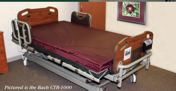
Pictured is the Bach CTB-1000

The Vienna CTB-901 is the best choice for long-term care and post acute environments. The slate deck and tubular steel design are superior to any bed in this class. It features a five-function motor system that allows for Trendelenburg, reverse Trendelenburg and cardiac chair positioning. Its length expands from 76 to 80 or even 84 inches. When you want a bed that can meet every need, Vienna is the best choice.